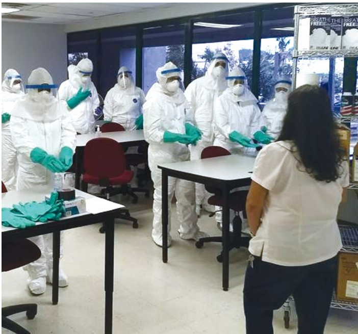
First responders receive training on use of personal protective equipment.