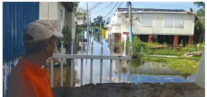
Resident looks at damage left by hurricane in Puerto Rico.