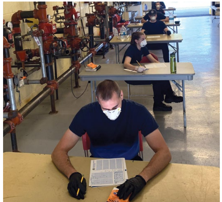
Fire fighters taking a HazMat operations course during the COVID-19 pandemic.

Pathogen safety data guide: WTP developed a pathogen safety data guide and training module for program awardees and other occupational safety and health groups involved in infectious disease response. The module includes a PowerPoint presentation, a participant worksheet, a glossary, four case studies, and an instructor guide.