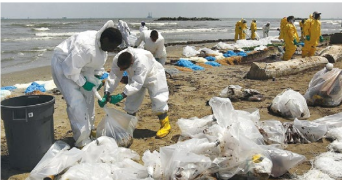
Workers helping with cleanup following the Deepwater Horizon Oil Spill. (Photo courtesy of Deep South Center for Environmental Justice).