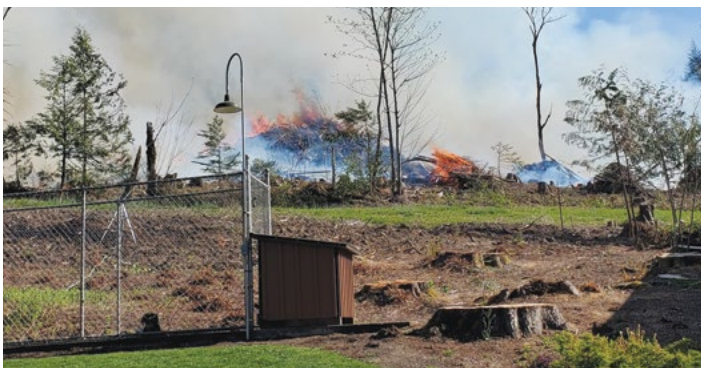
Fire in Mt. Baker-Snoqualmie Forest located in Washington State. (Photo courtesy of Western Region Universities Consortium).